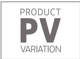
Product variations Other colours and specifications available on request