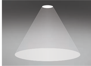
/WB Wide beam reflector