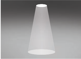
/NB Narrow beam reflector