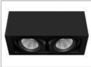
/BK Black body and gimbal