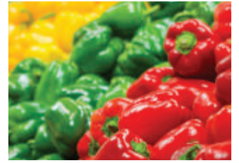
/R9 High colour rendering (Ra 90)