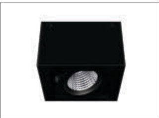
/BK Black body and gimbal